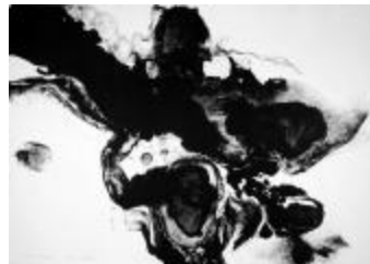
The Snake (19710144)