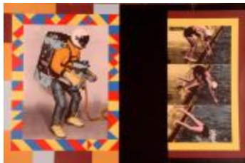
If You Can Count, You Can Play from Night Croquet (19720153)